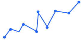
Percentage of Women Business Lead