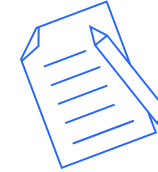
Percentage of Women Editorial Lead